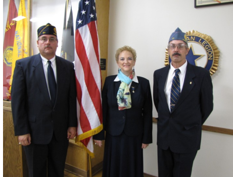
2013-14 Leaders Installed on July 9

Did you know that there are an estimated 21.5 million veterans in the United States! How many are Legion members? Not even 10 percent. We owe it to them to inform them of the positives of membership.